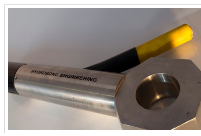
Strain Terminations / Mechanical

Our Electrical Engineers and Technicians are fully trained and certified on our equipment by City & Guilds.