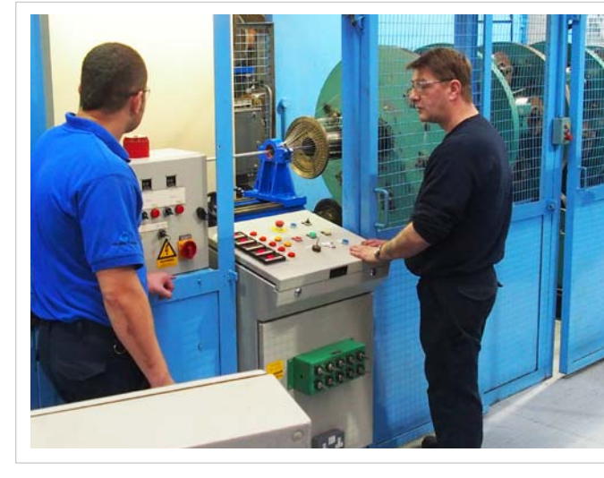
Operations / steel wire armouring of subsea cable

Most power cables incorporate either a steel wire or aluminium armour. There are many advantages with an armoured cable including superior crush resistance, better cold impact and cold bend performance, and a broader range of acceptable installation practices.