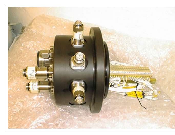
Subsea / Underwater Pressure Housing

Our Electrical Engineers and Technicians are fully trained and certified on our equipment by City & Guilds.