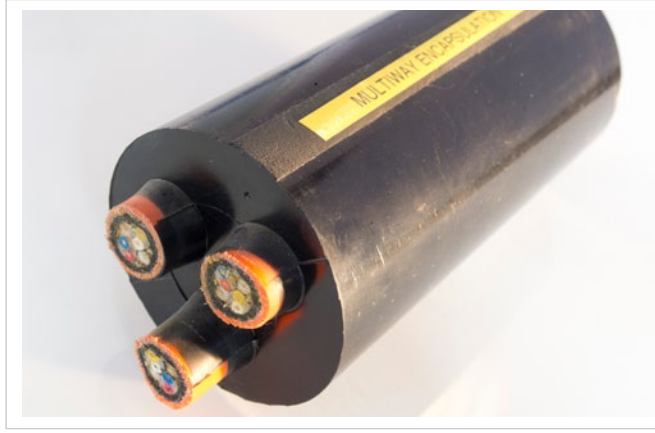
Encapsulation / subsea cable multiway